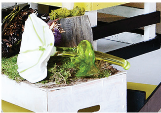
FIORI di LUNA (Moon Flower) 3500