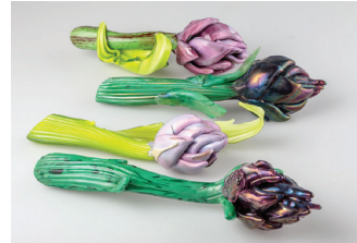
CASTRAURE (Baby Artichokes) 2000 Each