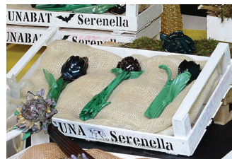
FIORI DI ZUCCA (Zucchini Blossom) 2000