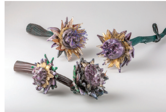
FIORI DI CARCIOFFI (Artichoke Flowers) 2500 Each