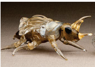
API (Honeybee) 3000